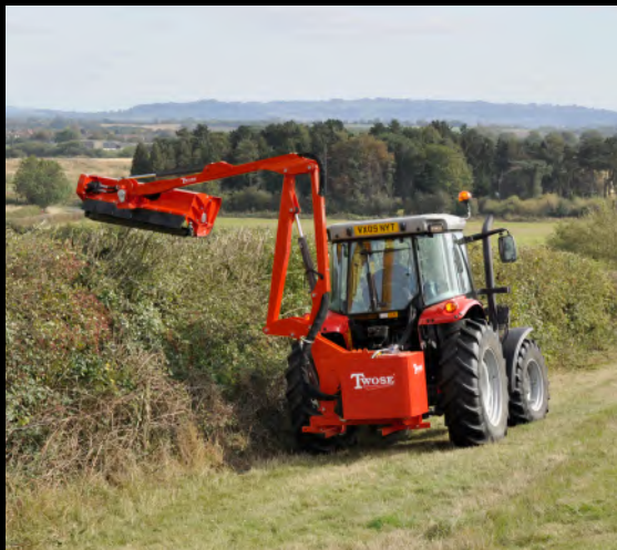
Featuring Low Pressure hydraulic controls. See page 19 for details.

With a choice of control systems, including Twose's proven low pressure hydraulic proportional joystick, the TW 50-3 is intuitive and easy to master and comes with a wide range of working attachments from Cutterbars to Sawheads.