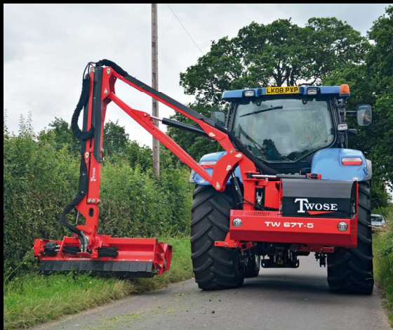
Oil cooler fitted as standard. See page 20 for details

Three different armsets are available including: Standard; Telescopic – for adding or retracting up to 1.0m of extra reach on demand; and Cranked Forward Reach (CFR) – enhancing comfort, visibility and reducing fatigue.