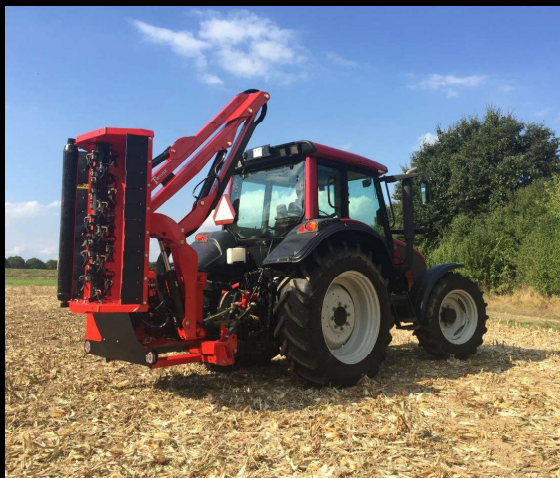
The 4-Series incorporates Hydraulic Slew. See page 21 for details

Compatible with tractors of just 60hp and upwards, the machine is equipped with a double-skin heavy duty 1.20m flailhead and is available with more than 10 different cutting attachments, including Sawheads and Cutterbars.