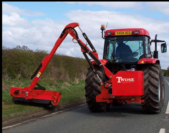
Featuring Low Pressure hydraulic controls. See page 19 for details

Created for farmers seeking a simple, straightforward machine, the TW 48-2 features the proven precision of cable controls, as well as cast iron pumps and mechanical safety breakaway for durability, while the new optional high-visibility LED road lights enable operators to work safer and longer.